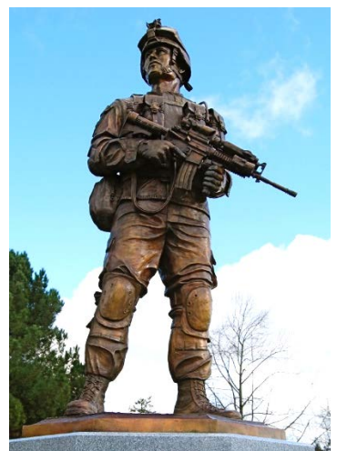
Arrowhead Brigade Memorial at Fort Lewis