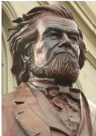
Governor Francis Pierpont