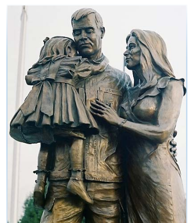
The Military Family Memorial