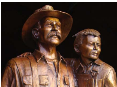
Harvey & John Parish