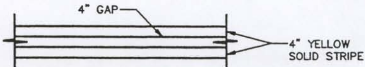
DOUBLE YELLOW CENTERLINE STRIPE